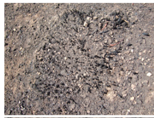
Close-up view of perennial plant effected by a hot burn. All dead material is burnt, perennial plant is blackened.