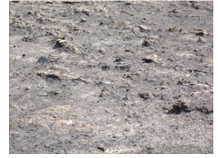
Very hot burn – no plant material visible, earth has a blackened, charred appearance.