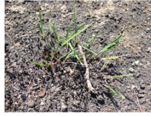
Perennial plant recovering from a hot burn.