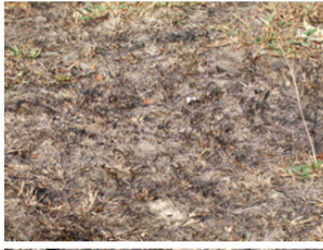
Cool-moderate burn – pasture is charred, but not completely blackened. Recent rains have initiated recovery of perennials.